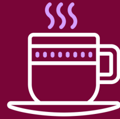
Complimentary Tea & Coffee