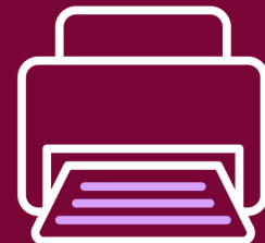
Printer Access with Email Login