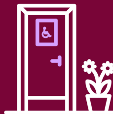
Disability Toilet Access