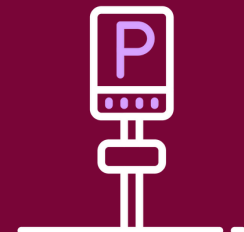
Onsite & Street Parking