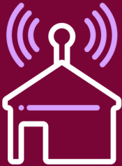
High Speed WiFi